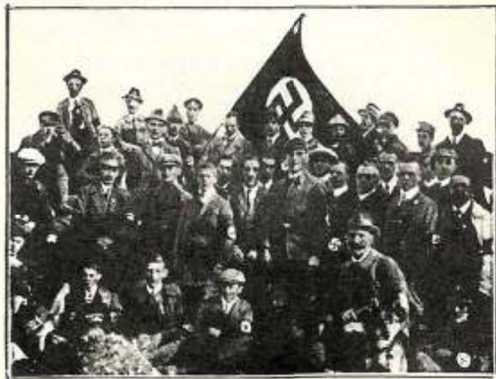
A RARE OLD PHOTOGRAPH of the German Nazi Party in the early days when they were poor and struggling as we are now. Note the lack of uniforms.

But the RESULTS of this historic meeting will shake the earth and send the hate-crazed Jews screaming into "orbit" with fear!