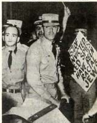
American Nazi, member of spearheading group headed by George Lincoln Rothwell, was placed right in effort to hold off spectators at 25th and Locust.