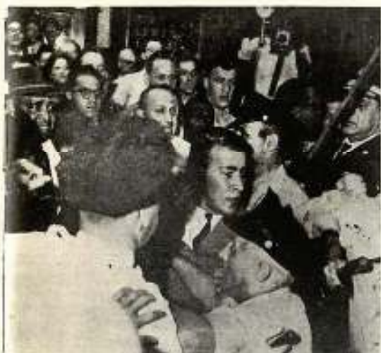
The Face of an American Nazi

The street before the ADL was RED with Jew blood!