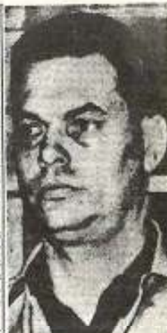
GEORGE L. ROCKWELL "How right the Fuehrer was!" with which it appeared, was shipped into West Germany even before Eichmann was hanged. South American Newsmagazine Atlantic

The speed with which Rockwell's Nazis have worked to capitalize on Eichmann's execution has flabbergasted German officials. Much of the material apparently was prepared long in advance of Eichmann's death, and some of it, judging from the speed